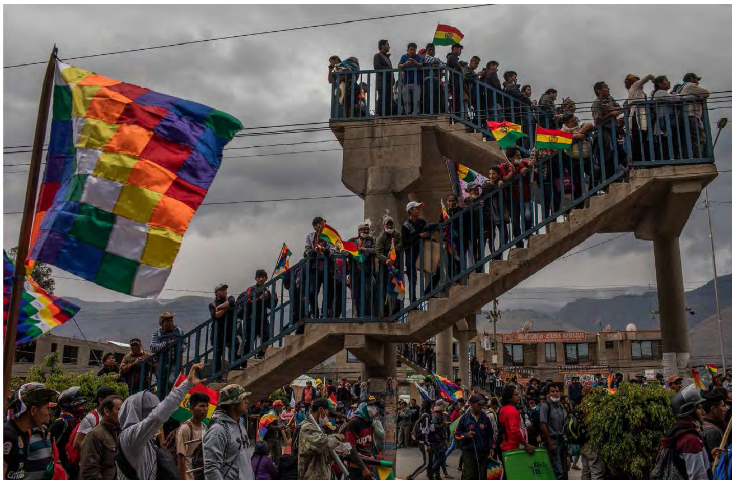
Bolivia, Nov. 14. Supporters of ousted Bolivian President Evo Morales held up the multicolored Indigenous flag during a protest near Cochabamba.