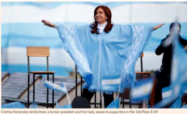
Cristina Fernandez de Kirchner, a former president and first lady, waves to supporters in Mar Del Plata

return in Argentina, no runoff (URY will have a runoff) Macri concedes gracefully, for the first time in a Century a non-peronist President exits via an orderly election. Now we are focused on Bolivia, Chile and Honduras. The midterm focuses on the resource curse and a lack of industrialization has hindered growth in much of Latin America (OECD members Chile and Mexico are supposed to be exceptionw, Guide to 2019 Elections . After massive rioting Chile made Ecuador look tame... President Lenin Moreno's government decided to cancel and IMF supported adjustment program