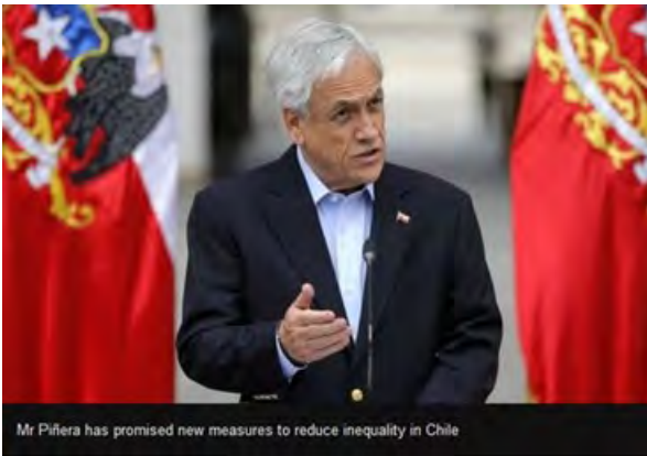
Chile's President Sebastian Piñera has dismissed his whole cabinet in order to form a new government and introduce social reforms demanded by protesters.

Midterm Review: TNT Midterm Notes v1 (see p 13 & 14) Sachs & Larraine, 1993 Chapt 21 (also on BB) Lectures: Midterm Review Slides The Resource Curse ECON 5450 The TNT model Getting to know the RER