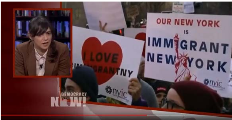
Mexican Writer Valeria Luiselli on Child Refugees & Rethinking the Language Around Immigration 7,204 views