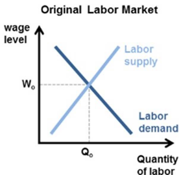
Figure 1 Labor Market pre-immigration

SA-6 The moving to opportunity project (MTO) was similar to Lean Season except that instead of bus tickets, recipients were chosen at random to receive Rent vouchers (see slide 13, five cities 4,600 families). At first there were modest effects of moving, on adults ( see slide 19 ) but when they returned to look at the children under 13 who moved with their parents, they found large gains in income (see slide 32). Tracking children of parents who moved was made possible using “big data” in this case tax returns to match parents to children. SA-6B Draw analogies between this result and the immigration of refugee families with young children. Who benefits the most from better schools and a safer neighborhood