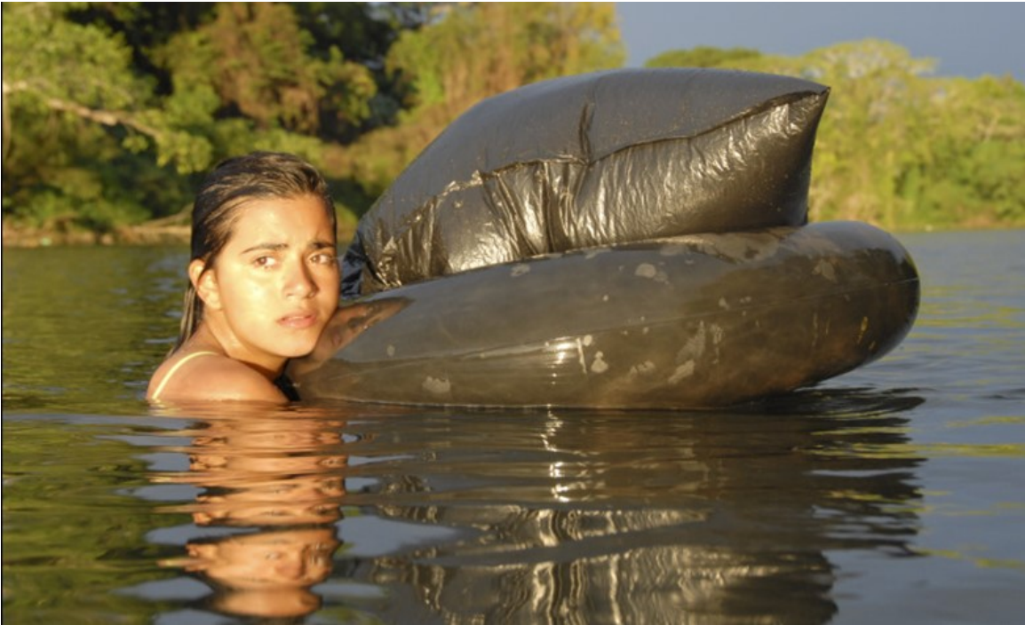
Unaccompanied minor, Crossing the Rio Grande in the United States in Sin Nombre