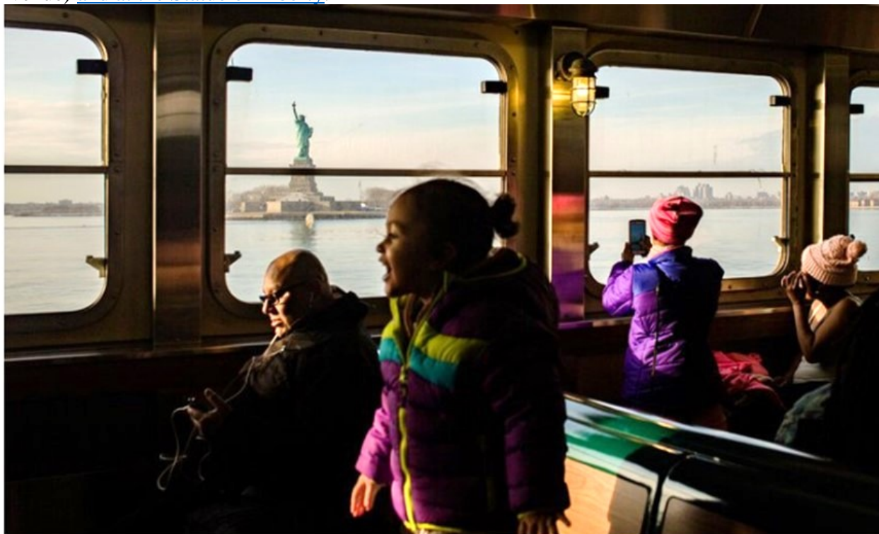
The Statue of Liberty was closed on Sunday because of the government shutdown. Under a deal between federal officials and New York State , however, the monument and nearby Ellis Island are expected to open today.

January 22 nd 2018: The government shutdown closed the Statue of Liberty Sunday, but it should reopen today...the origins and meaning of this statue and the poem inscribed on it have become a point of controversy. It also figures famously (my view) in Episode 4 of Ken Burns New York documentary, see below. Why did the French give New York this monument? Parts of the 2014 On Emma's poem and the Statue: see PBS NY Documentary, Episode 4 "Power to the People" Intro 1 st 4 mins longer Intro 1 st 8 mins (full poem) Full Episode 4 (1:50 hours) James Gray's 2013 feature the Immigrant was filmed in the Bronx (on Hughes Avenue) and at the Statue of Liberty .