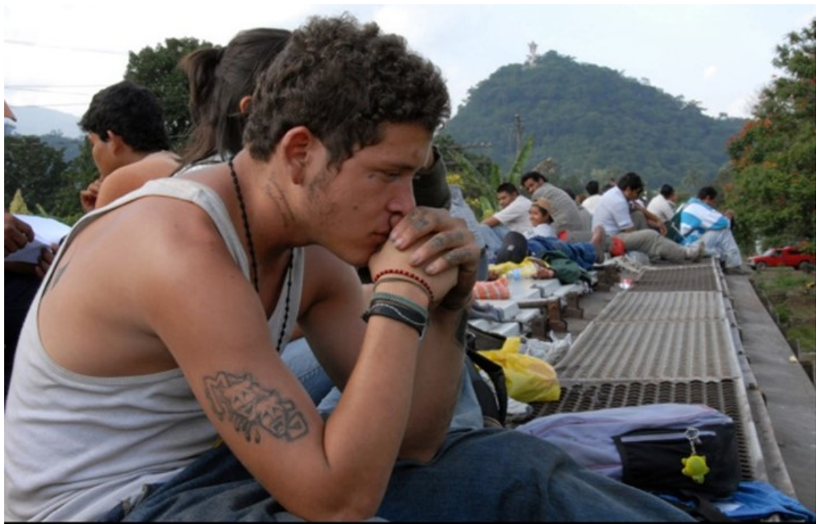
Our not so bad after all hombre, making the wrong decision in Chiapas Mexico... Sin Nombre Trailer (sorry for Lexus ads, you cannot skip...)

They ride a famous train through Mexico “The Beast” as in the mix tape, “Immigrants (we get the job done)”