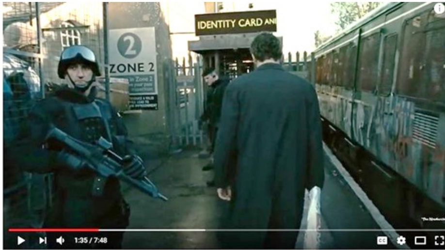
Children of Men: Don't Ignore The Background